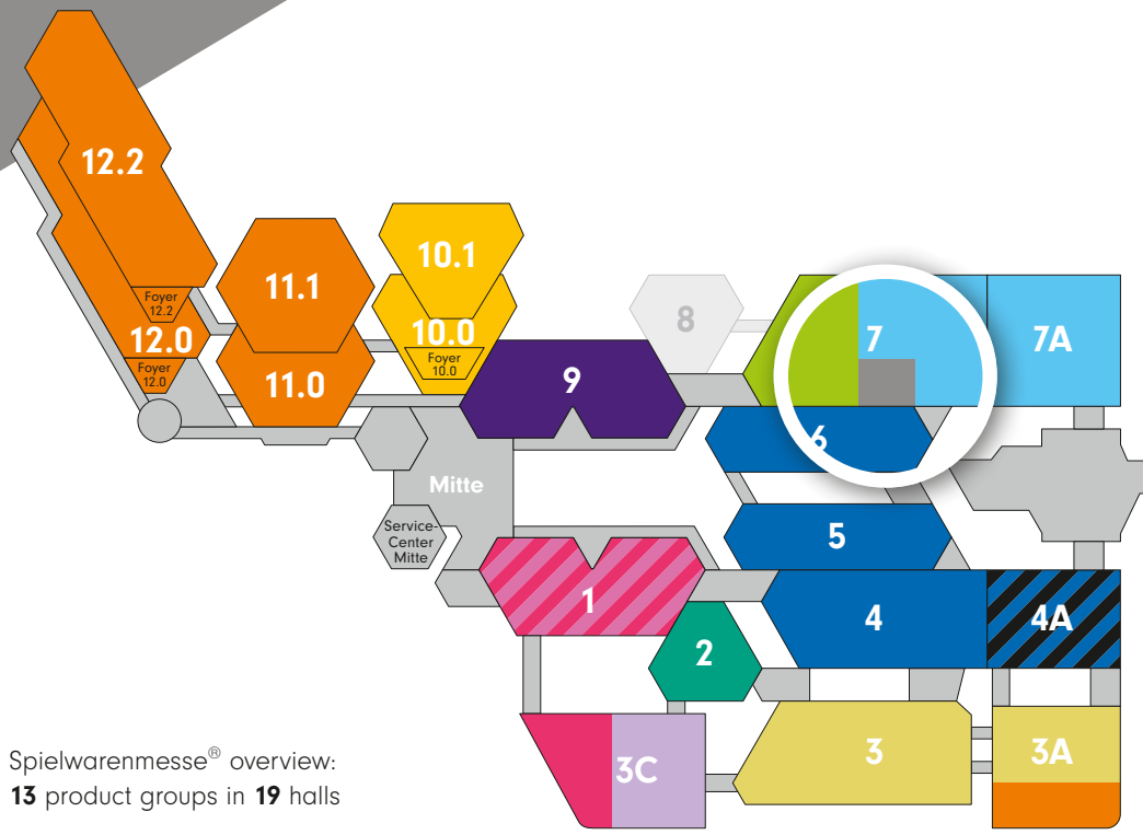
Spielwarenmesse® overview: 13 product groups in 19 halls